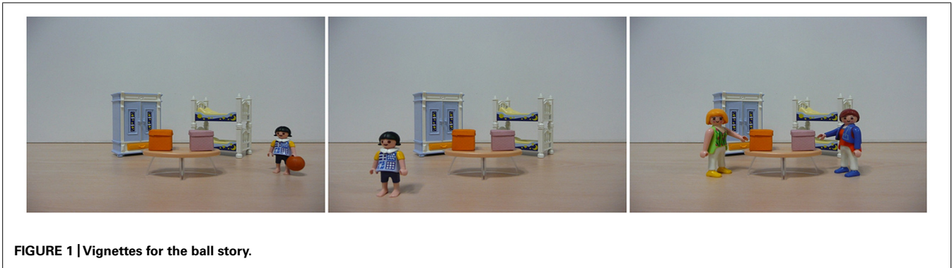
FIGURE 1 | Vignettes for the ball story.

The two other stories were built on the same model. In each of them, the young girl, the object carried, the colors of the boxes and their places (right/left), the two female informants, their names and their places (right/left), the two female informants, their names and their places (right/left) were varied. The child could obtain a maximum score of 3 points (1 point for each story when the box linked to the more fluent statement was chosen).